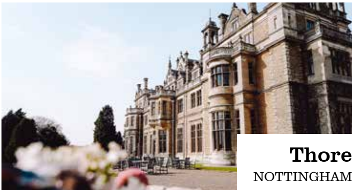
Thoresby Hall NOTTINGHAMSHIRE NG22 9WH