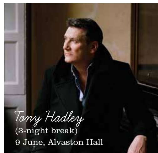
Tony Hadley (3-night break) 9 June, Alvaston Hall