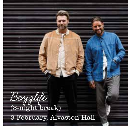
Boyzlife (3-night break) 3 February, Alvaston Hall