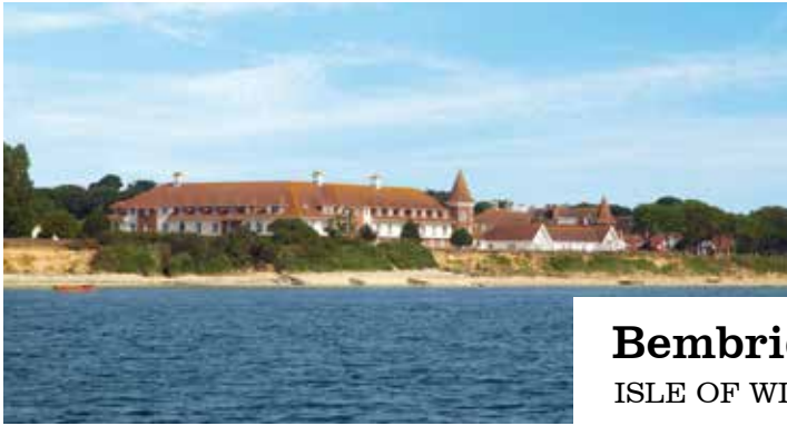
Bembridge Coast ISLE OF WIGHT PO35 5TB