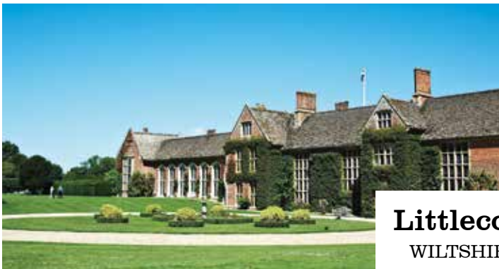
Littlecote House WILTSHIRE RG17 0SU