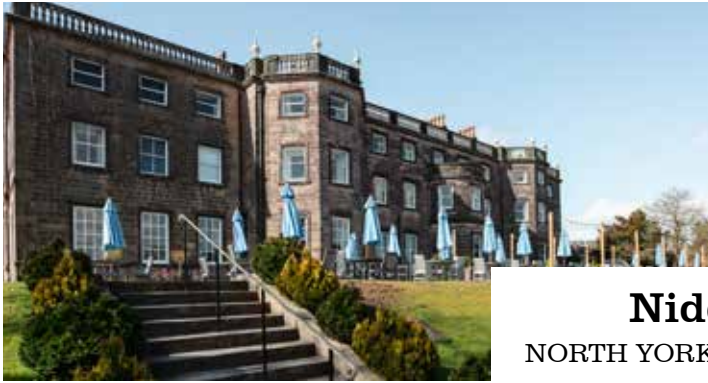
Nidd Hall NORTH YORKSHIRE HG3 3BH