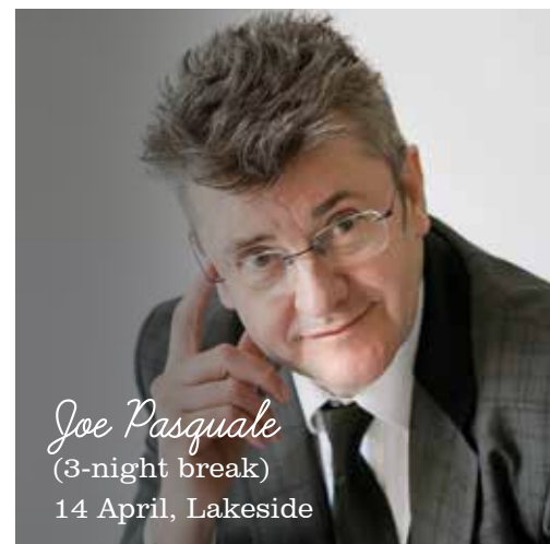
Joe Pasquale (3-night break) 14 April, Lakeside