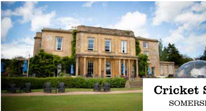
Cricket St. Thomas SOMERSET TA20 4DD