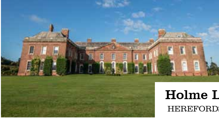
Holme Lacy House HEREFORDSHIRE HR2 6LP