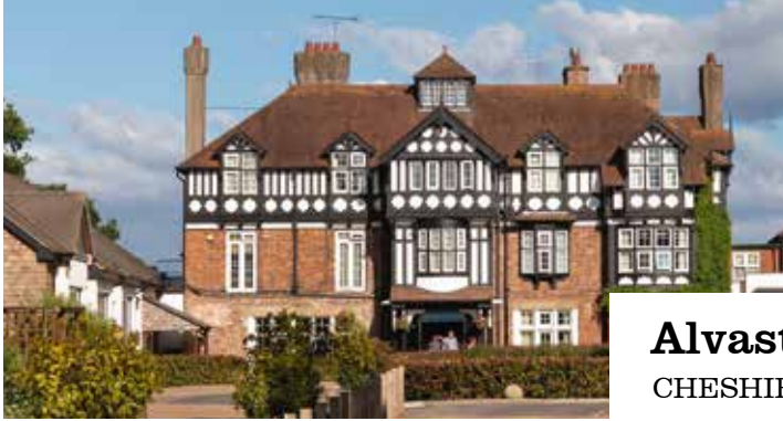
Alvaston Hall CHESHIRE CW5 6PD