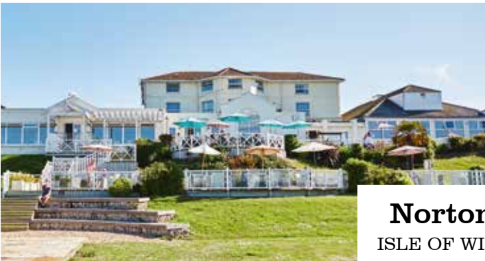
Norton Grange ISLE OF WIGHT PO41 OSD